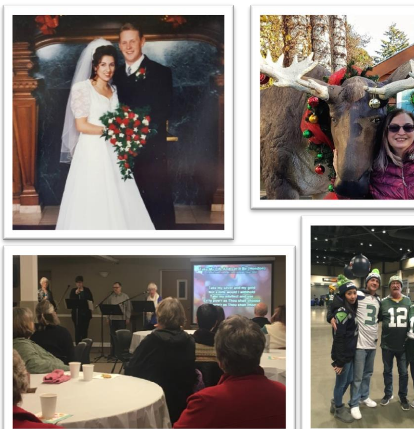
Equipped in the Spirit...Equipped in the Word Going everywhere...meeting needs in Jesus Name